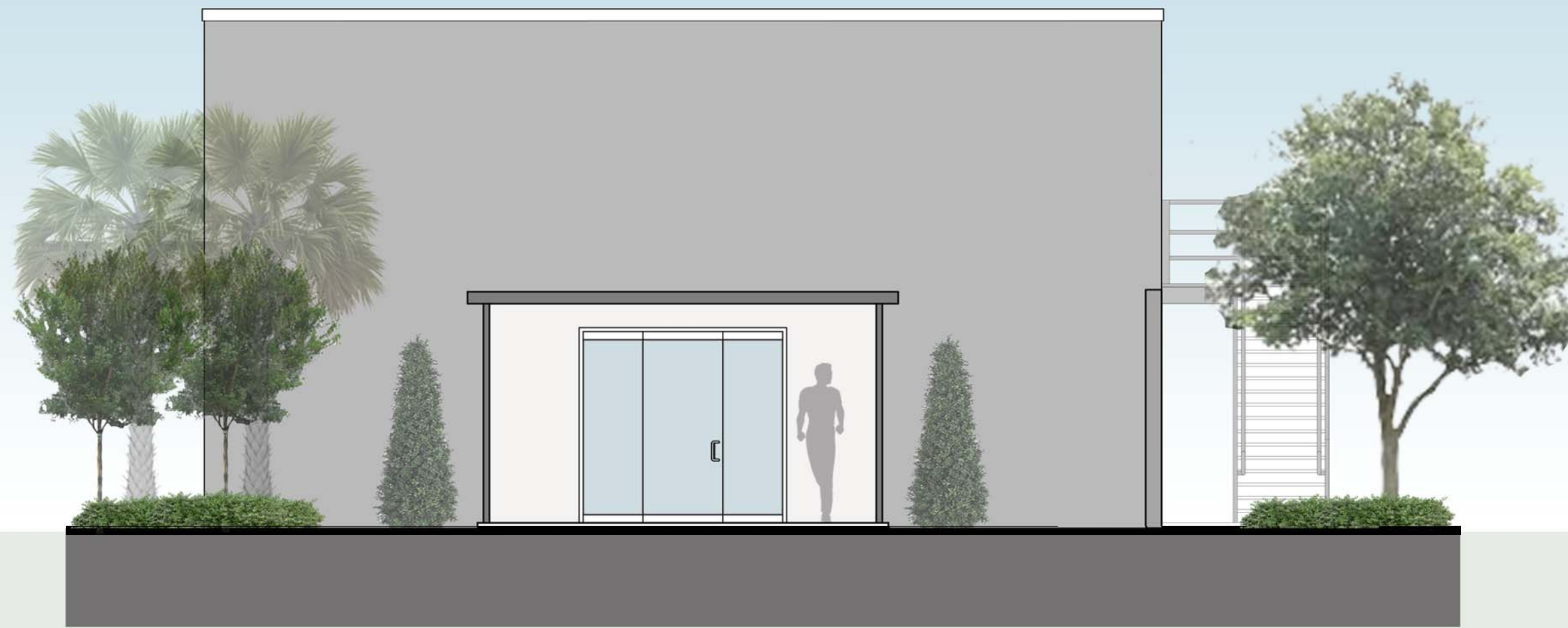
① Existing North Elevation :: Front SCALE: 3/16"=1'-0"